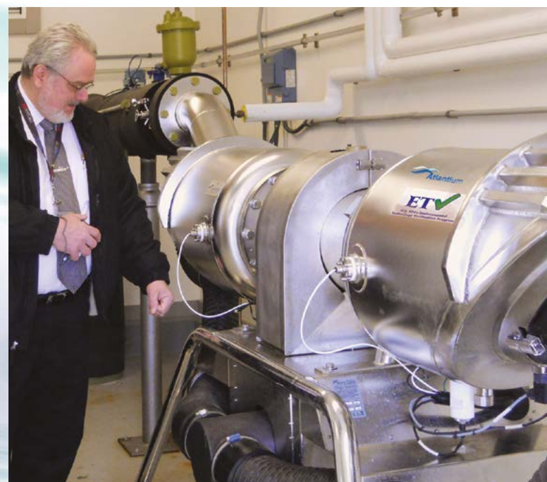
Regulator inspects the Atlantium UV system in Mohawk NY

Atlantium support starts at the beginning and goes on. Five years later, after a severe storm flooded the Village (2013) and damaged the municipal water infrastructure, Atlantium pulled out all the stops to get another unit on-site and installed immediately, even before the Municipality emergency funding was approved. Atlantium commitment to service and support continues.