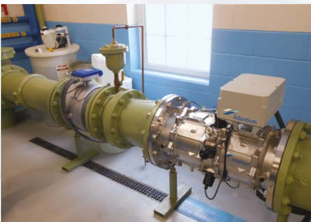
Atlantium easy-to-maintain UV system disinfects the drinking water for a small public water system in Massachusetts

Validated Atlantium Medium Pressure UV can provide the dose you need at lower energy.