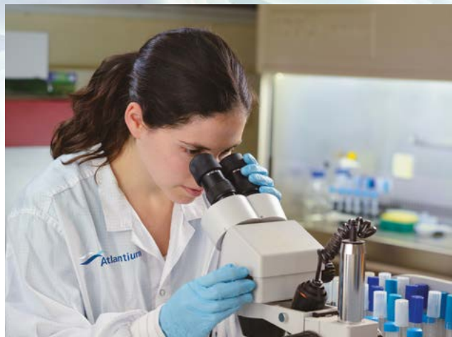
Atlantium microbiologist examines water specimen

An engineering study compared Atlantium Medium Pressure UV for 4-log virus credit with chemical and other treatments: UV can win! Ask us for a copy!