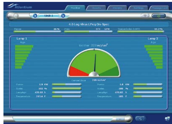
The monitor displays the real-time data, including actual dose delivered

With Atlantium, even small systems can afford large-system technology & performance. The small footprint, modular design and extensive validated envelope of operation means a sustainable solution with instant reports documented and verified in real time.