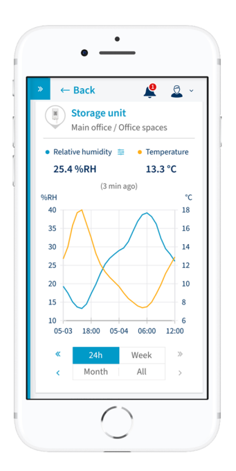
Graph on mobile screen