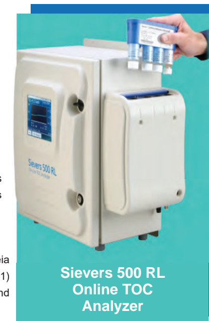
Siewers 500 RL Online TOC Analyzer