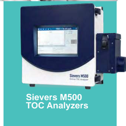
Siewers M500 TOC Analyzers

The Sievers M500 is our third generation online TOC analyzer designed for accuracy, efficiency, and integrity. This reagentless analyzer continuously monitors organics in ultrapure water for pharmaceutical, microelectronics, semiconductor, and power applications.