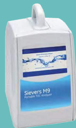
Siewers M9 Portable TOC Analyzer

Veolia is the first company to offer reference materials to support the Japanese and Korean Pharmacopoeia TOC requirements.