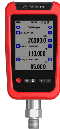
Additel 260EX with ADT158Ex module