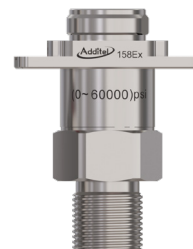
"ADT158Ex pressure module - for use with ADT260Ex (bottom mount)"