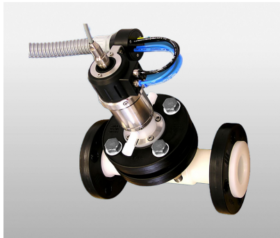
EXconnect connected to retractable probe housing