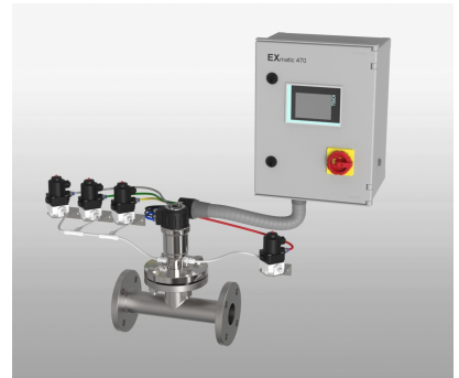
Measuring point with probe housing, flow-through fitting and control unit