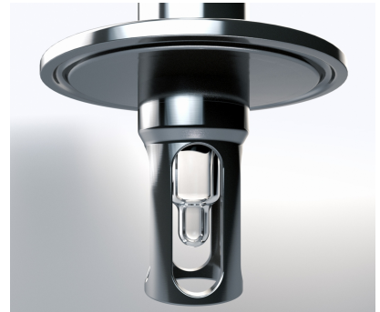
Version with protective cage