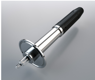
EXstatic 311 - version without protective cage