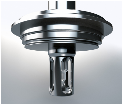
Process connection VARIVENT N with protective cage