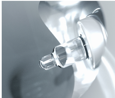
EXstatic - installation situation from inside