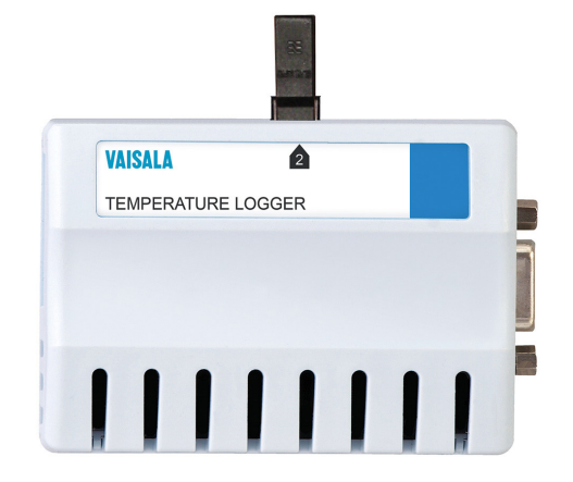
Data logger model VL-1000-21x