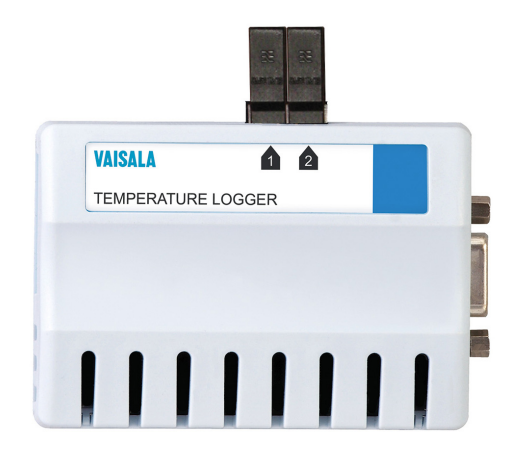
Data logger model VL-1000-22x