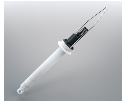
EXdip 920 - version with suspended holder