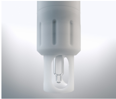
Cleaning nozzles integrated in the protective cage of EXdip 920