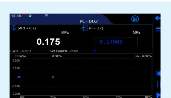
Pressure gauge / transmitter / switch calibration