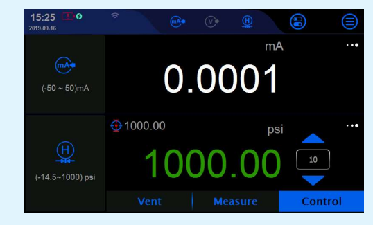
High Pressure Automated Calibration