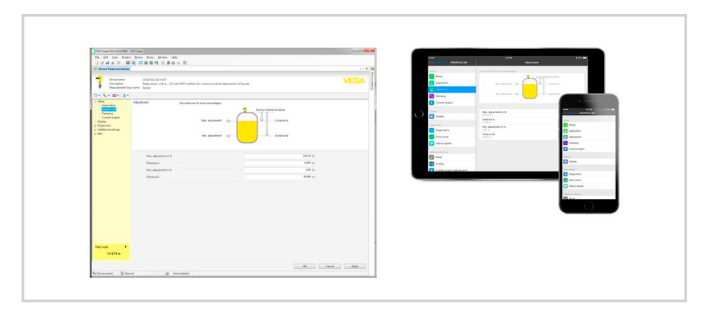
Adjustment via PACTware or app

Operation is via a free app from the "Apple App Store", the "Google Play Store" or the "Baidu Store". Alternatively, adjustment can also be carried out via PACTware/DTM and a Windows PC.