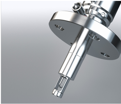
Process parts with sensor in measuring position