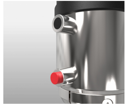
Unlocking pins and position indicators on manual drive unit